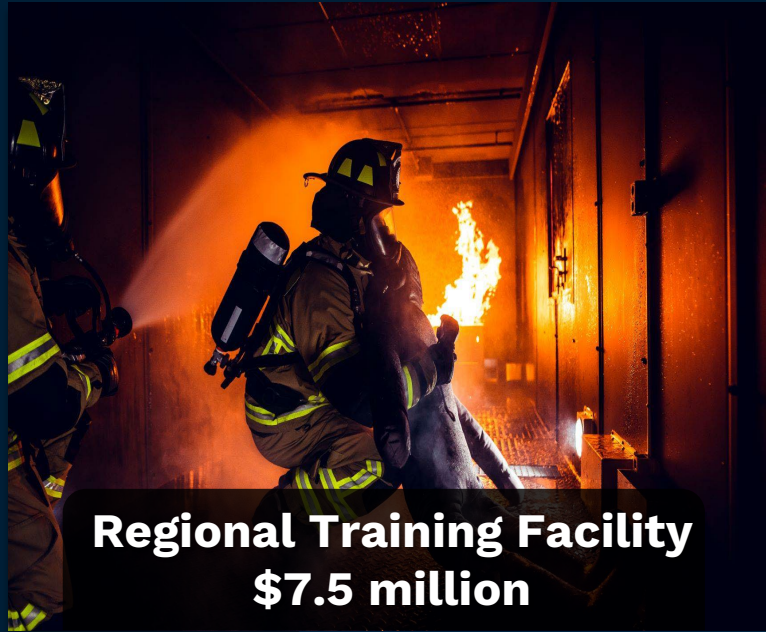
Regional Training Facility $7.5 million