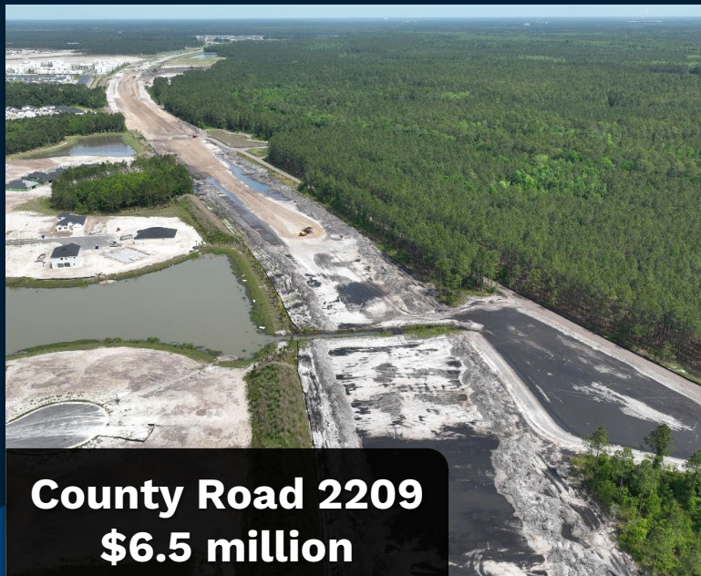
County Road 2209 $6.5 million