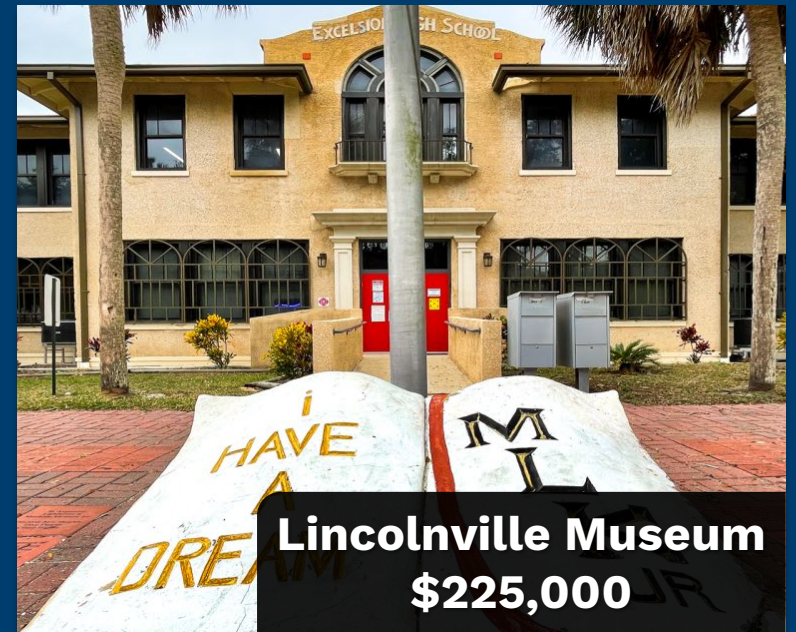
Lincolnville Museum $225,000