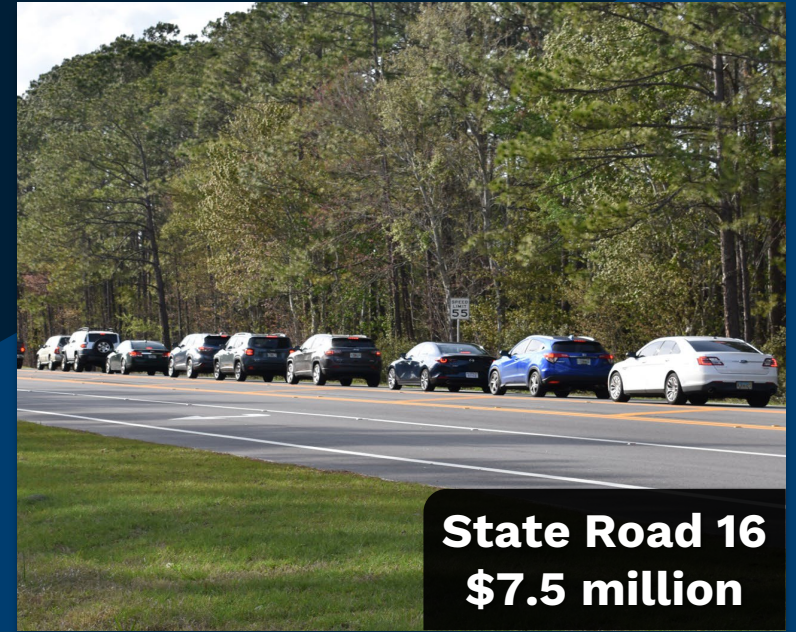
State Road 16 $7.5 million