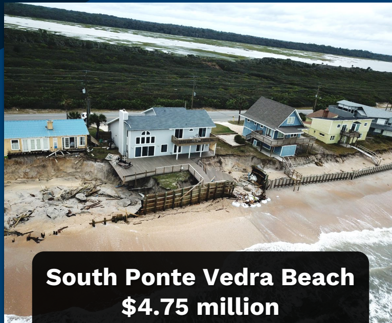
South Ponte Vedra Beach $4.75 million